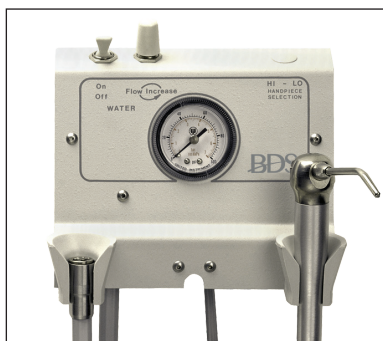
Unit head dimensions (w x h x d) 6 1/8" x 5 3/4" x 3 1/2"