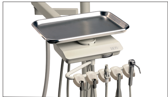
Unit head dimensions (w x d) (11" x 6½")