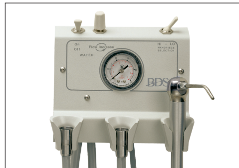
Dimensions (w x h x d) 6 1/8" x 5 3/4" x 3 1/2"