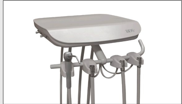
Unit head dimensions (w x d) 14" x 13"