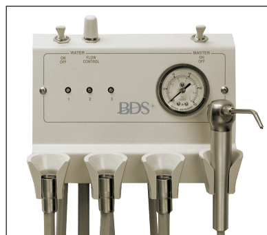
Unit head dimensions (w x h x d) 7" x 5 3/4" x 3 1/2"